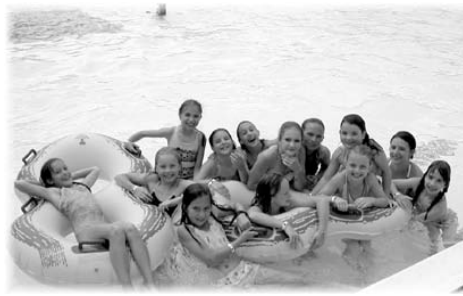
Campers enjoy a cool dip.

Of course, in order to be successful, we must strike a balance between hard work and recreation. Our rest times are