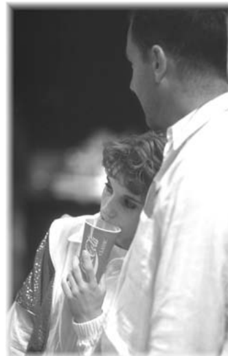
Rick Palumbo with 2X Olympian Kerri Strug

Because... You are one of only 40 invited gymnasts. Because... 5 days of directed, focused and inspired training. Because... You can train 6 hours each day under some of the country's best coaches.