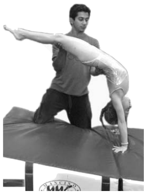
Raj Bhavsar, 2008 Olympic bronze, 2004 Olympic Team