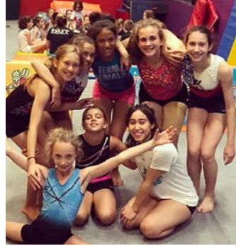
Katelyn Ohashi, NCAA National Champion, American Cup Champion, 4X US Team Member.