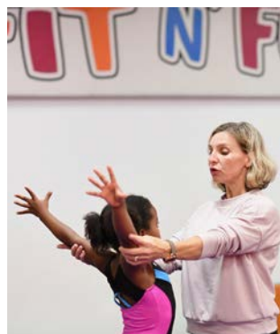
3X Olympic Gold Medalist and 7X Gold Medal World Champion Daniela Silivas.

Our philosophy has been the same for over 30 years. The Aerials program builds confidence through