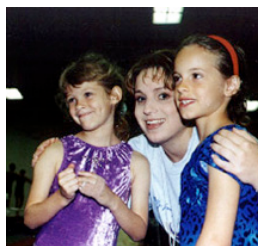
Olympian Kerri Strug

Hey, how about staff? Over the last 30 years of conducting camps and clinics, We have been privileged to have some of the most respected and knowledgeable staff available. Take a look at this partial list of folks who have taught at our camps in the past. They