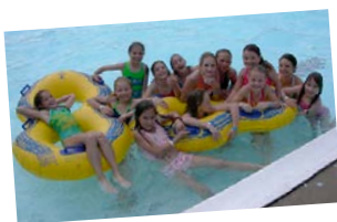
Campers enjoy a cool dip AT THE FRENCH CREEK POOL in ELVERSON

Whatever your choice, you can rest assure that your children have quality supervision and safety as campers are under 24-hour observation by either our adult staff in the gym or a club parent, or coach, outside the gym. For all athletes attending, our medical doctor is on call 24 hours a day.