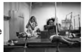
NEW: Ask for the Ninja Zone Party, ages 6+

A great surprise for any child is a birthday party at Aerials. Your young guests will love the thrills of personal gymnastics instruction and the unique equipment that's only available at Aerials.